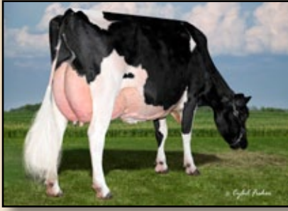
SIRE CLAYNOOK DISCJOCKEY

DAM SIEMERS DOC HANAN 29100-ET VG-86 sired by Woodcrest King Doc 1-11 3x 305 d 15,304 Kg M 4.2%F 3.1%P