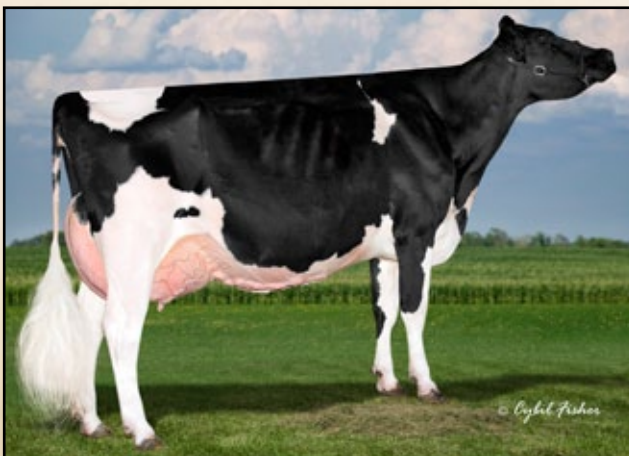
COOKIECUTTER MOG HANKER-ET EX-94 Hano's 3rd Dam